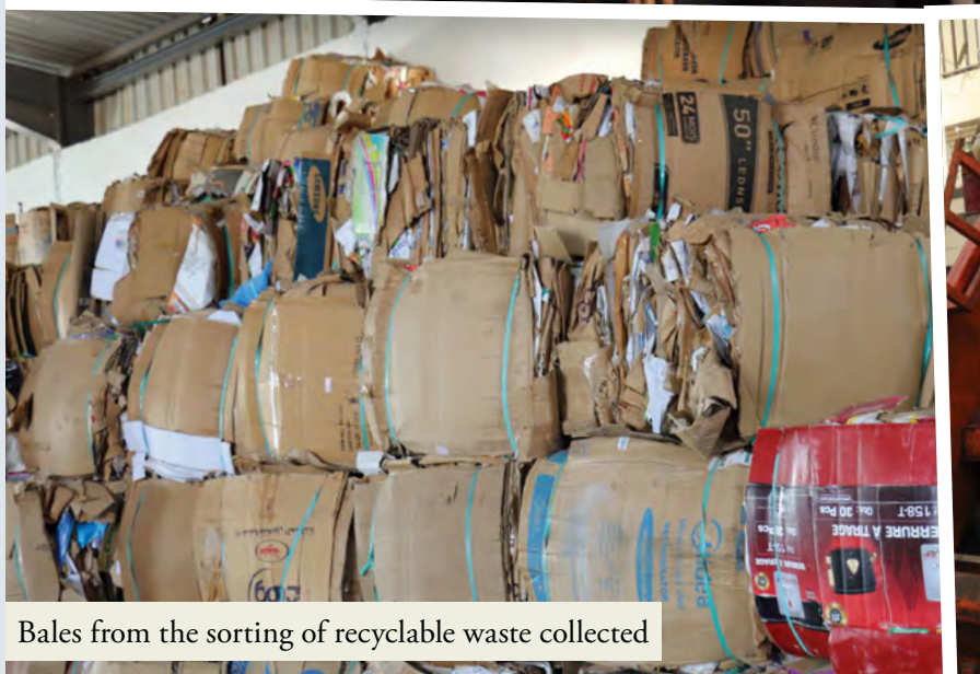
Bales from the sorting of recyclable waste collected